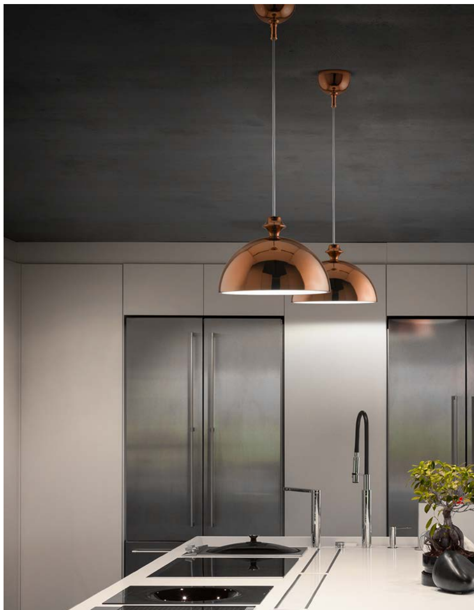
2) Art. L8/CU